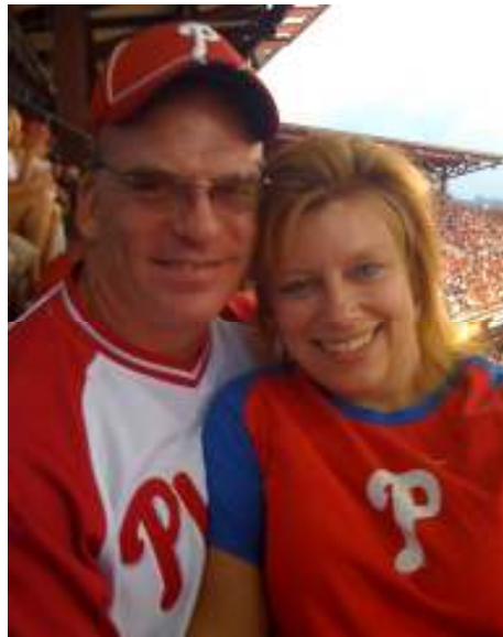
TWO LOVE BIRDS

Celebration Worship Services Every Sunday Morning 8:45AM Prayer 9AM Worship Celebration 9AM Sunday School for all ages 10AM Refreshments & Fellowship Time